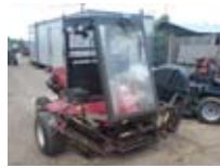
Toro 5300 fairway mower £2950+vat