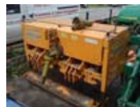
Aeroking 1.65 deep tine spiker £4500+vat