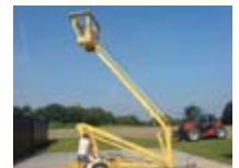
Upright It 33, 33ft access turns 360 deg, highway trailer, controls top and bottom, ideal for lopping branches extra £4850+vat

DIAL A DIRECTOR 01245 362377 / 07770 400900 GRASSHOPPER GROUND CARE EQUIPMENT EST 25yrs