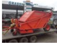
Kubota 4ft hydraulic sweeper collector £2500+vat