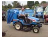
Iseki SGR 19 DIESEL high tip, 48inch mower £4500+vat