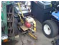
Trench fitted with new chain £750+vat