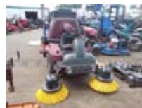
Road sweeper, Kubota diesel, only 92hrs from new, wonder hose kit, water applicator, ideal for car parks extra £5950+vat