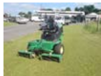
Roberine 500 John Deere diesel, 1292 hrs, fixed head cutting units, Reg 02, hydro, power steering £3950+vat