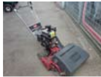
Toro 500 greensmower from £950+vat