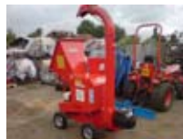
Trolley mounted 3" chipper shredder, honda eng, hydraulic feed, blower attachment AI condition £2500+vat