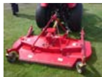
New finishing mowers from £850+vat