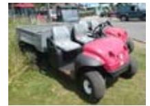
Electric workman with roll bar and tip kit £2950 + vat