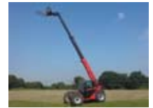
Manitou M932, yr 06 only 450hrs, 4wd, 4 wheel steer, forks and bucket unused £27500+vat