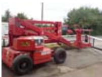
Genie z445, 22, self propelled cherry picker, 360deg, 45ft telescopic cage , 920 hrs only £6500+vat