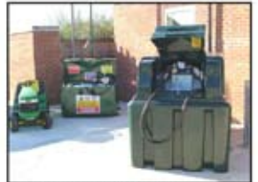
2500 Ltr FUEL STATION