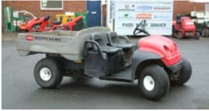
Toro Workman, various from £ 2,500