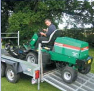
Trailers for Machinery