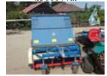
Wessex 4ft heavy duty sweeper i ex demo condition £2500+vat