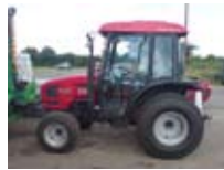
Our demo TYM 451, 27hours, warranty £14500+vat