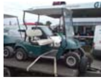
Ezgo electric golf car only 380hrs £1250+ vat