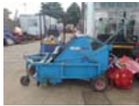
Wessex 4ft sweeper £1500+vat