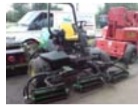
JD 3235C fairway mower , 720hrs £6500+VAT