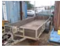
2.6ton road trailer, ramp, winch. £1250