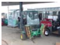
Roberine 500, cab, aircon, floating heads, grassboxes, 3 wheel drive £5950+vat