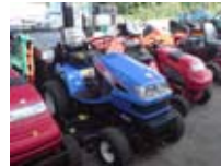
Iseki SXG 19, diesel, 48 inch mower, 550lt collector new £6300