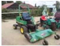
JD 1145, 822 hours only, fitted with 1.5m flail £4950+vat