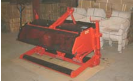
Charterhouse Verti-Drain, fully reconditioned, various from £ 4,000