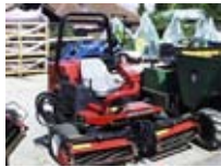
Toro3100 sidewinder diesel triple £7500+vat