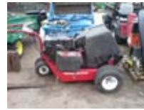
Toro ped corer £1950+vat