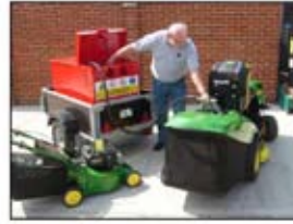
MOBILE PETROL CADDY 216 LITRES