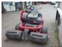
Toro 3250 diesel greensmower yr 2004, 1126hrs, groomers, scrapers £5500+vat