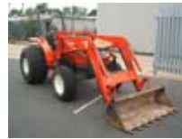
Kioti DK 50, 50HP 800hrs, Large turf tvres. £12500+vat