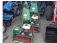
LLOYDS Palladin greensmower from £950+vat