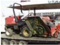
Toro 455 batwing rotary, 4wd, £6500+vat