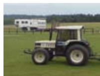
70hp 4wd drive, turf tyres £9750+ vat