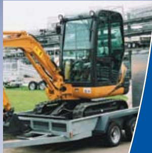
Trailers for Plant

For further information call 0800 720 720 or visit www.indespension.com