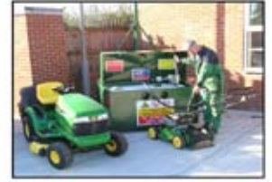
MIDI 975 LITRE & MAXI 1950 LITRES