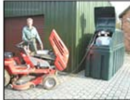
1350 Ltr FUEL STATION