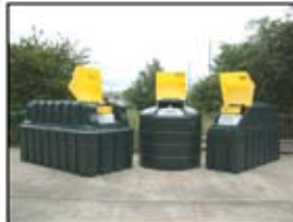
WASTE OIL TANKS