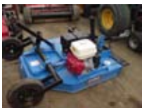
Amtex 1.20m, honda engine, topper £1650+vat