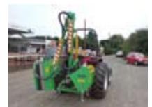
M380 side arm flail new £4500+vat