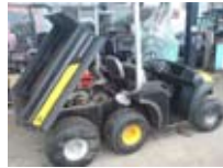
JCB diesel truck, tipping body, rollbar, £4950+vat