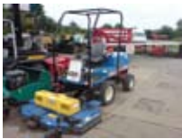
Iseki sf 300 diesel fitted with port agri 1.5m rotary £4500+vat