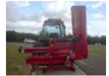
Hakki poke 60 tractor mounted log cutter, splitter little used £3000+vat