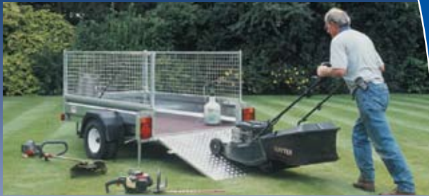
Trailers for Park Maintenance