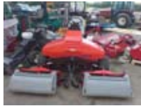
Jac 1900 diesel triple mower with grassboxes £4500+vat