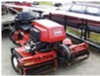
Toro 2300 triple mower £3950+vat