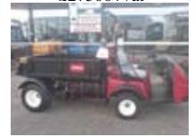
Our demo Toro 4300 workman truck full warranty phone for special offer price.