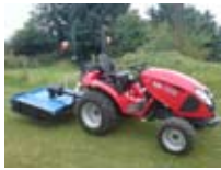
New TYM 273, 27hp with new pasture topper £9500+vat