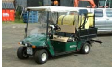
Ezgo workhorse, various from £ 2,500