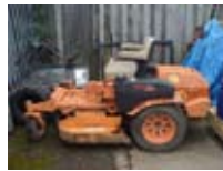
Scag turf tiger £3650+vat