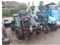
Hayter 324 diesel triple £5950+vat