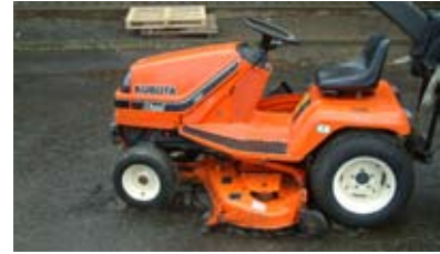
Kubota G1900s, 48" cut £ 2,500